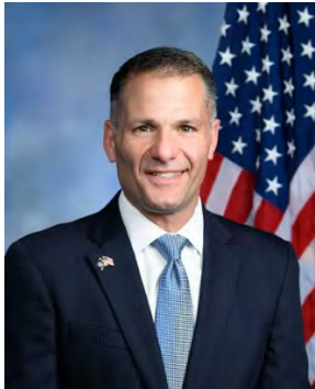
Marc Molinaro Administrator Federal Transit Administration

Administrator Marcus J. Molinaro brings a lifetime of public service and a results-driven record to the U.S. Department of Transportation. A lifelong New Yorker, Marc most recently served as the U.S. Representative for New York's 19th Congressional District. In Congress, he was a member of the House Committee on Agriculture, the House Committee on Transportation & Infrastructure and the House Committee on Small Business—advocating for rural economies, infrastructure modernization and small business growth across Upstate New York.