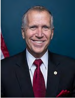
THOM TILLIS (NC) U.S. Senator

Sen. Thom Tillis was first elected to represent North Carolina in 2014 and is currently serving in his second term after being re-elected in 2020. Sen. Tillis is a member of the Senate Finance Committee, Veterans' Affairs Committee, Banking, Housing, and Urban Affairs Committee, and Judiciary Committee.